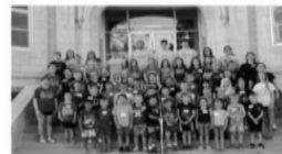
What is Totus Tuus?

Totus Tuus is a week long summer Catholic youth program dedicated to sharing the Gospel and promoting the Catholic Faith through evangelization, catechesis, Christian witness and Eucharistic worship.